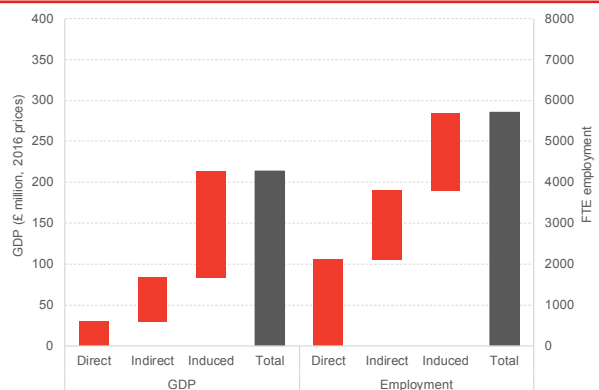
Chart 2: Net economic impact of SPFL activities on Scottish GDP and employment, 2017-18