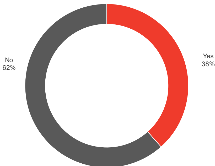
Chart 1: Do you feel that your business is prepared for Brexit?

One of the key reasons for this appears to be a lack of adequate information available to plan for different potential outcomes of the Brexit negotiations.