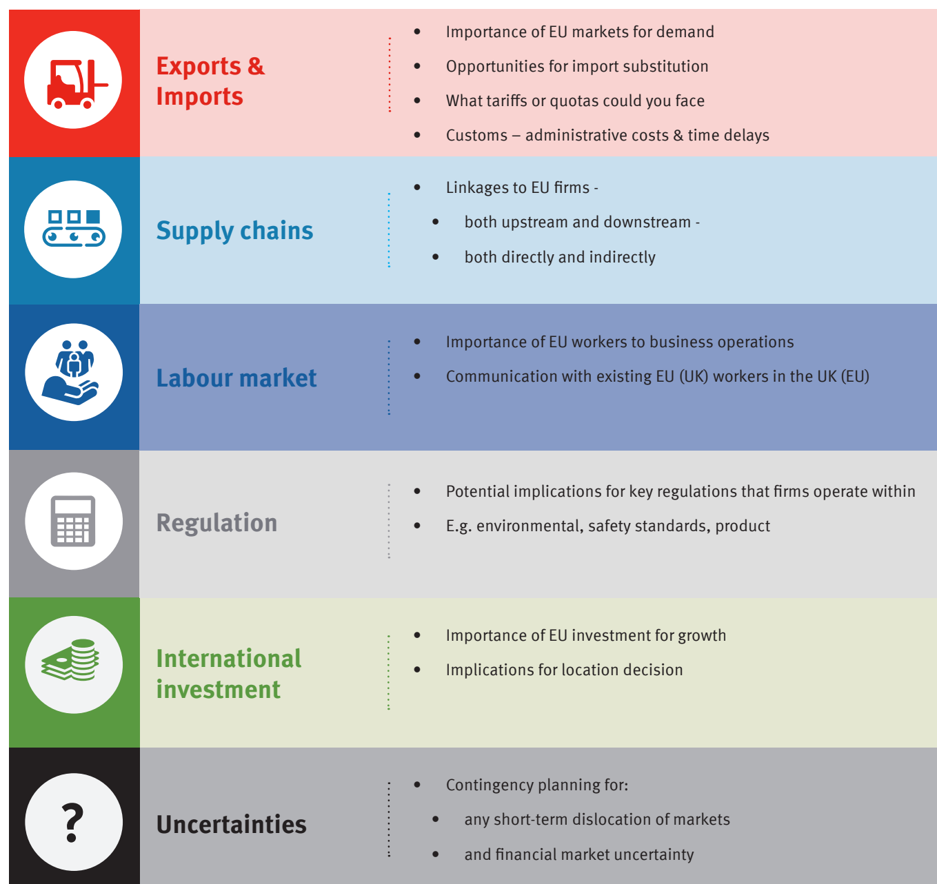
Table 5: The Fraser of Allander Brexit Dashboard

The table below provides a checklist for organisations in considering the effects of Brexit.